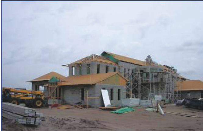
TNAH® 2006 was certified by the Florida Green Building Coalition Inc. for using environmentally sound construction materials and principles, including ICYNENE LD-C-50™ i .