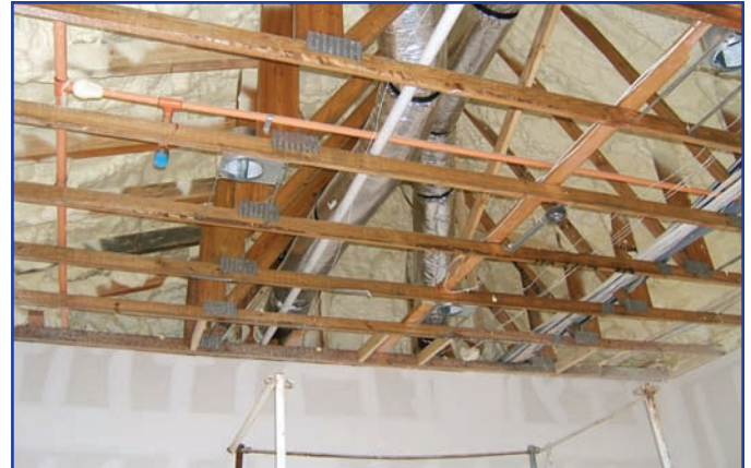
ICYNENE LD-C-50™ was applied to the underside of the roof deck creating a sealed, unvented, and conditioned space for ductwork and air handlers.

Another goal of this project was to introduce production builders to advanced insulation strategies while focusing on airtightness. ii